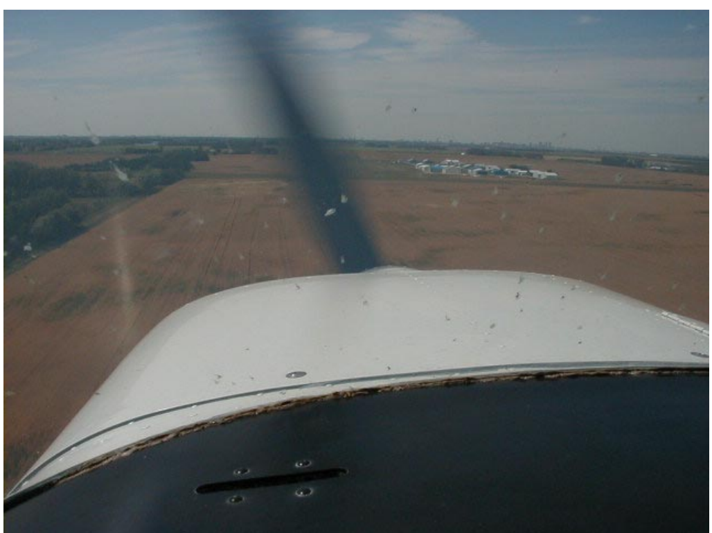
1:00PM. Since there was no delay at the customs I was on my way in 15 minutes. The 130 kt mile was the fastest. The wind was squarely on my back and in a little over an hour I reported left downwind for 27 at Lyncrest.